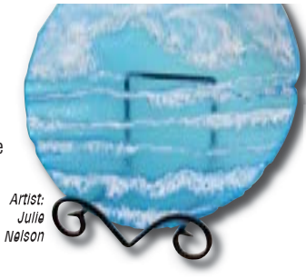
Artist: Julie Nelson

Create a truly unique piece of art in this two week intermediate fusing class. Students will fuse and slump a 12" sculptural bowl while learning about the fusing cycles required to create dimension and depth using fiber products and frit. The following week will include applying frit to add detail and texture. The bowl will be slumped after the glass and can be picked up or mailed at a later date. Students will work with 96 COE glass; including sheet glass and frits. Some fusing and glass cutting experience is required. Materials are included. Tools and some materials included. 2 Weeks, Tuition: $95 Monday, February 28 ..... 5:30pm-8:30pm Thursday, April 7 ..... 5:30pm-8:30pm