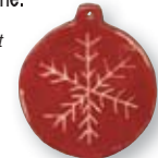
Artist: Steena Gault

Create personalized copper enamel ornaments in this one day class. Learn the ancient art of copper enamel; firing powdered glass onto copper to create unique holiday adornments. Customize to your personal taste and take home enameled ornaments that will become treasured holiday decorations for years to come. All materials included. 2 1/2 Hours, Tuition: $40 Sunday, November 7 ..... Noon-2:30pm Monday, November 29 ..... 6:00pm-8:30pm Saturday, December 4 ..... 10:00am-12:30pm