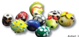
Artist: Val Oswalt

Learn to create unique and stunning glass beads! This class covers the basics including bead shaping, decorative techniques, proper use of various tools and glass, and much more! Tools and materials extra. 1 Day, Tuition: $65 Saturday, October 16 ..... 9:00am-4:00pm Sunday, November 14 ..... 10:00am-5:00pm Monday, December 27 ..... 9:00am-4:00pm Saturday, January 22 ..... 9:00am-4:00pm Sunday, February 20 ..... 10:00am-5:00pm